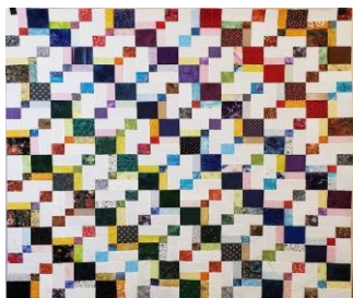
Beaded Curtain, A double disappearing 9-patch pattern

On June 3 Brita will be sharing her story and her quilts with us. Then on the next two Saturdays she will be conducting the following workshop.